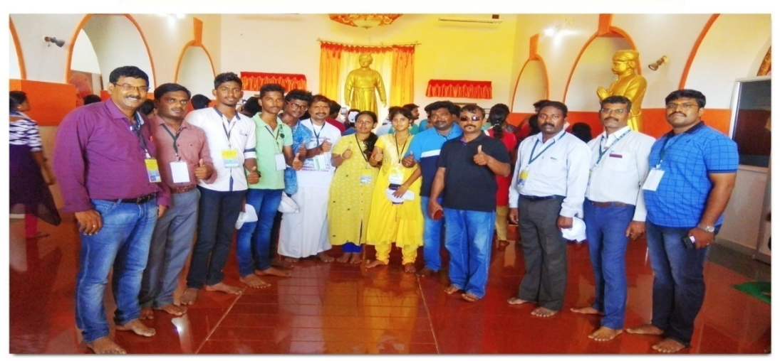
The Picture shows the place of Vivekananda's Visit to Tamilnadu after his Chicaco Visit. It is Located in Rameshwaram, Ramanathapuram District.