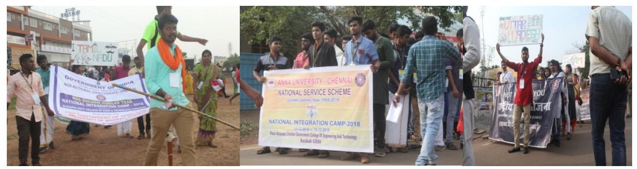
The incharge was handed over to the program officers of Assam, Odisha and Puducherry. Day 4 was end up at 9.30 pm.